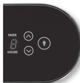
Fig. 6 Dimmer Function

NOTE: The Power (symbol) and the Bluetooth (symbol) icon will always remain illuminated.