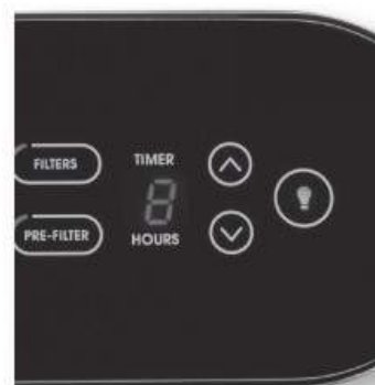
Fig. 5 Timer Function