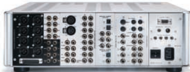
HTS 7.1 rear panel shown.

The analog circuitry—the most critical stage in a surround preamp/processor—features the advanced signal path developed for Krell's flagship stereo preamplifier, the Krell Current Tunnel. All eight channels employ fully balanced Krell Current Mode™ topology in a zero-feedback configuration, delivering a staggering 1MHz bandwidth. This circuitry assures the most transparent reproduction of today's most demanding movie soundtracks and high-resolution audio formats. In Preamp mode, the HTS 7.1 operates as a pure analog preamplifier, bypassing all digital circuitry to ensure the cleanest, most direct signal path.