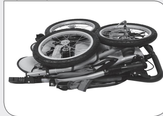
Storage and folding

Pull the back of the seats forward. It will be easier to fold if the seats are not in the recline position. Remove locking pins from side latches on the stroller frame (Double Models have 2 locking pins). Release the two latches from the frame. The stroller may automatically begin to fold, the front wheel will fold under frame and the handle will fold backwards.