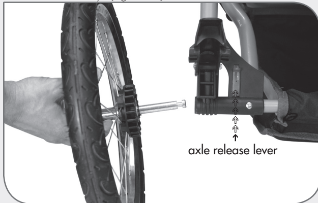
Rear Wheel Assembly - {Figure 1.b}

Unfold Stroller: Remove from carton and remove any packaging materials that may be holding the frame in closed position. Grasp frame handle and open. Lock both plastic latches, on sides, onto the lower frame, insert locking pin into hole in latch and frame, lock the pin in place by slipping the wire loop over the end of the lock pin. {see Figure 1.A}