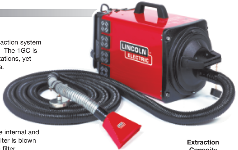
Shown with optional K639-5 Suction Nozzle

Extraction capacity: Low Speed: 55 CFM High Speed: 115 CFM