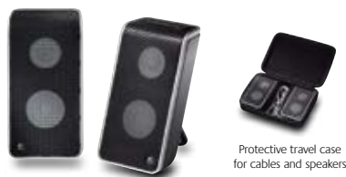
Protective travel case for cables and speakers