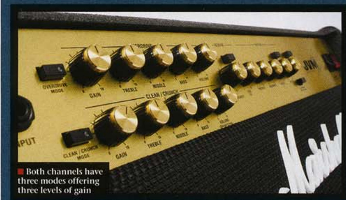
Both channels have three modes offering three levels of gain