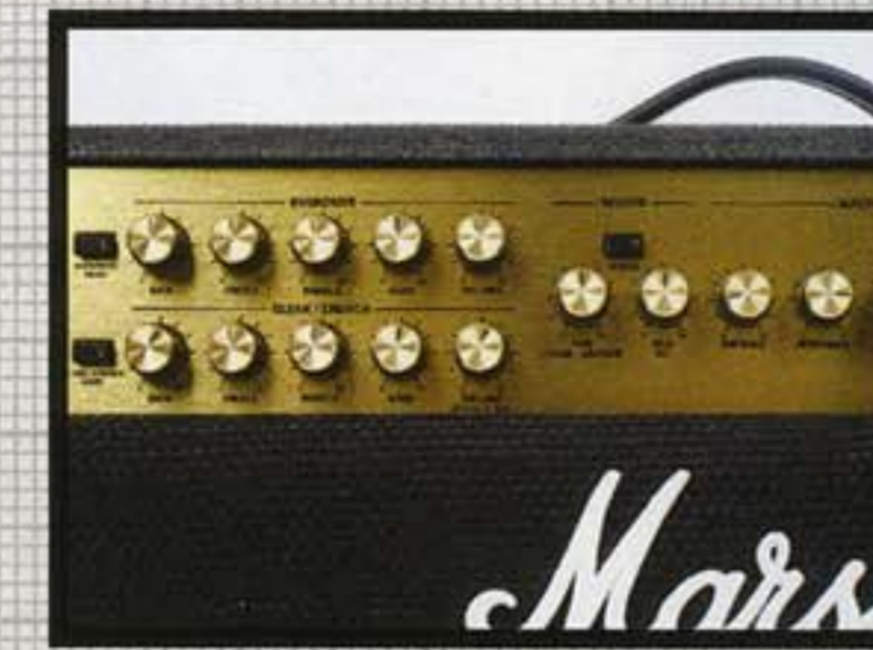
Independent controls for the clean/crunch and overdrive channels give you total control

FLEXIBLE FEATURES AND FANTASTIC MARSHALL SOUNDS