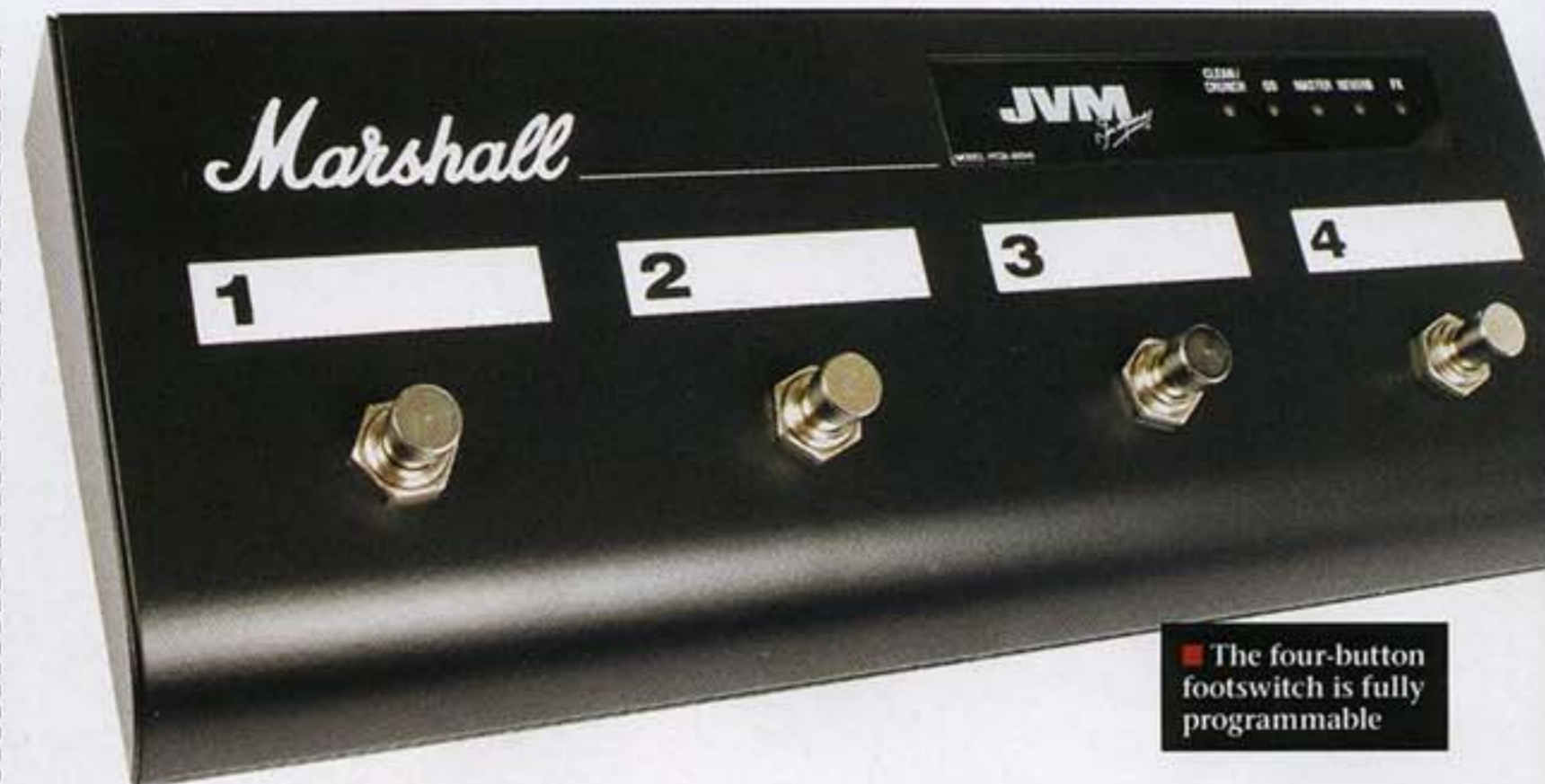
The four-button footswitch is fully programmable

channel, reverb, master volume and effects loop settings. It's perhaps worth pointing out that, whether using MIDI or the footswitch in 'preset store' mode, you can only recall the switch settings and not the position of the individual control knobs – these are regular pots that you adjust manually.