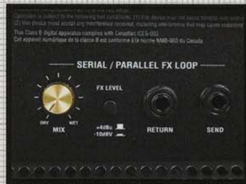
The serial effects loop has a recessed mix control and +4dBu/-10dBv level switch