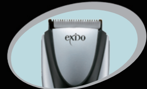
Ceramic and titanium blades