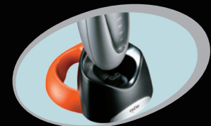
Cordless operation - for maximum freedom