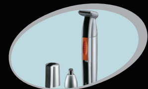
Stainless steel blades