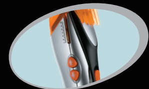
Automatic comb position