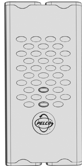
Figure 1. RK5PWR-120 Power Supply