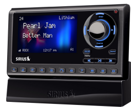
Sportster 5 in SUHC1 dock