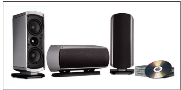
VM10 (PICTURED AS L/C/R SPEAKERS)