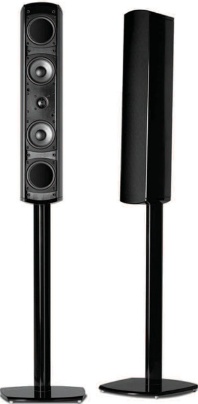
VM20 (FLOOR STAND OPTIONAL)