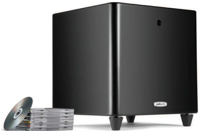
DSW PRO 400