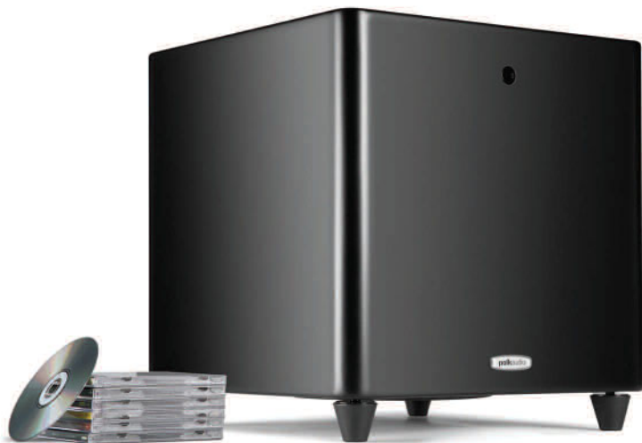
DSW PRO 500