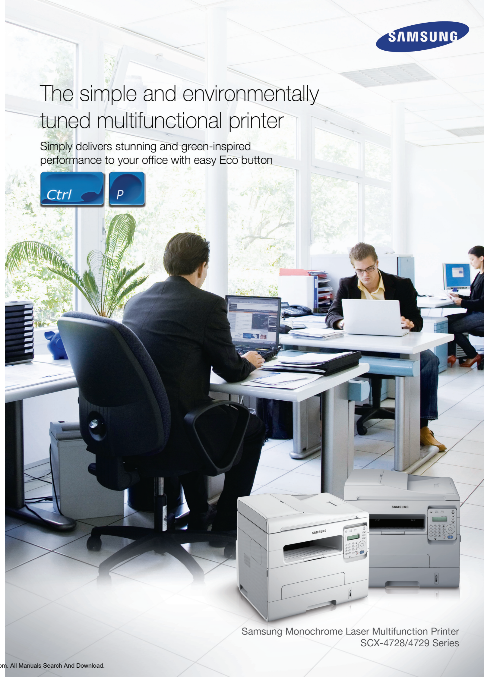
Samsung Monochrome Laser Multifunction Printer SCX-4728/4729 Series