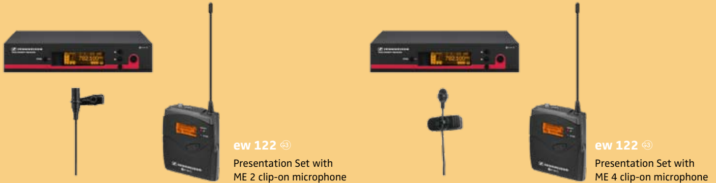
ew 122 Presentation Set with ME 2 clip-on microphone