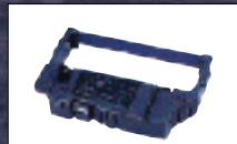
Ink Ribbon / RC100 (Purple)