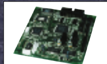
Control Board / BD500