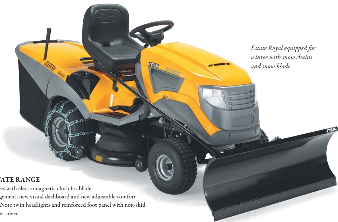
Estate Royal equipped for winter with snow chains and snow blade.

Top of the line among garden tractors, the Estate range comes with engines from 13.5 to 25 hp and implements for year-round use. Our best tip: Equip it for winter and spread the cost over the year!