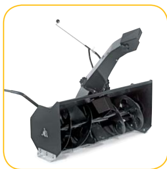
SNOW THROWER, PTO-kit required