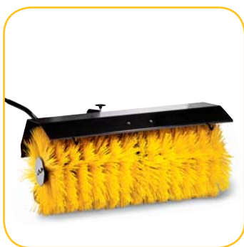
SWEEPER, PTO-kit required

Comes with electromagnetic clutch for blade engagement, new visual dashboard and new adjustable comfort seat. Note twin headlights and reinforced foot panel with non-skid rubber cover.