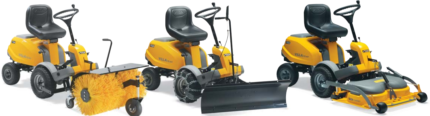
Villa with sweeper

The Villa range is the year round companion for home owners. If you want to get the most out of it: Get equipped for year round use and spread the cost over the year. For the full range of implements – see page 12!