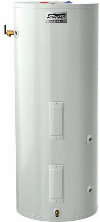
SSX62-80H-045S and SSX62-119H-045S