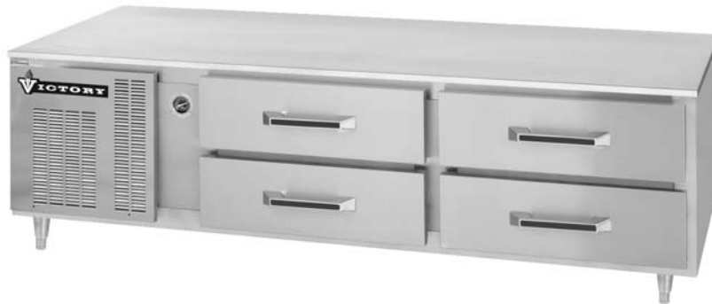
GFS-2-S7 Stainless Steel Tops are Optional

Remote Model Available (Two Section Models Only)