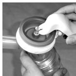
Step 4. Lift the handle and remove