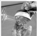
Step 5. Remove the rubber purple insert