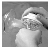
Step 6. Twist off the white housing

Be careful not to dislodge the purple rubber plugs within the white housing.