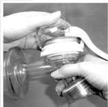
Step 3. Remove the clear dome