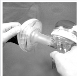
Step 2. Remove honeycomb