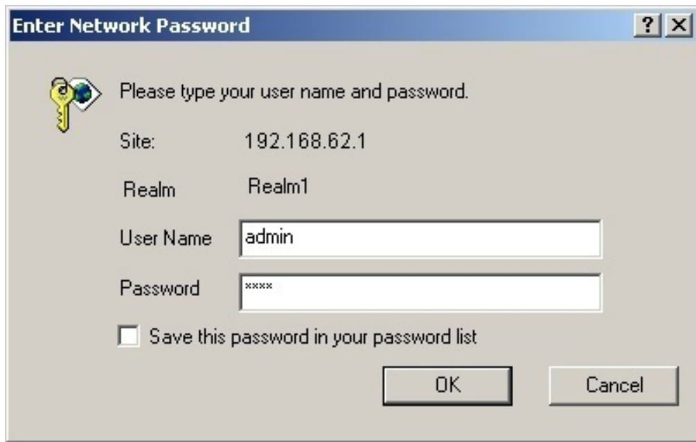
FIGURE 1: Logon dialog box