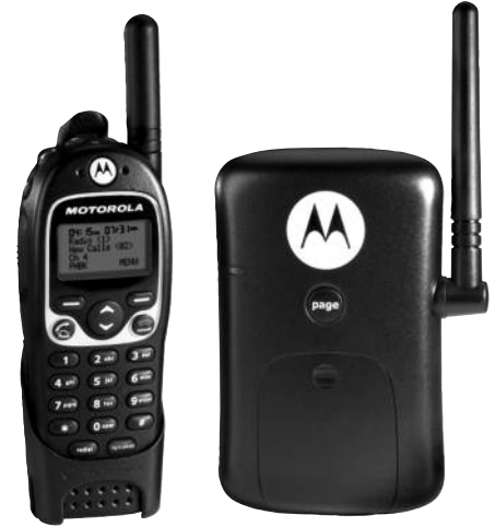
Handset Dimensions: 5.3"H x 2.1"W x 1.3"D Weight w/battery 7 oz., Color: Black