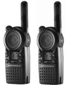
Dimensions: 4.1"H x 2.1"W x 1.1"D , Weight w/battery 5 oz., Color: Black