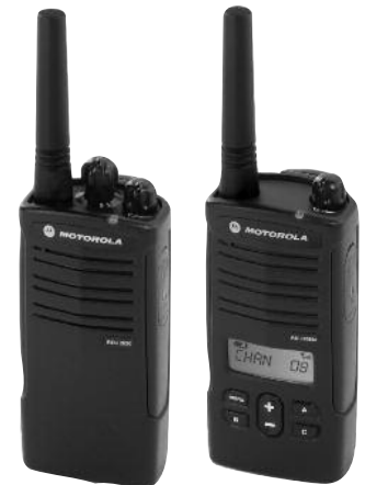
Dimensions: 4.5"H x 2.2"W x 1.6"D, Weight w/Battery 8.6 oz, Color: Black