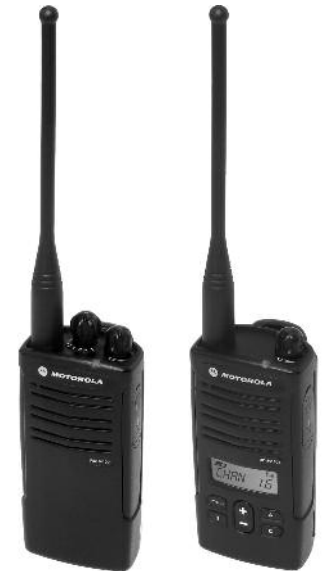
Dimensions: 4.5"H x 2.2"W x 1.8"D, Weight w/Battery 10.3 oz, Color: Black