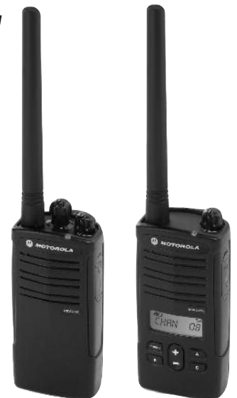
Dimensions: 4.5"H x 2.2"W x 1.6"D Weight w/Battery 8.6 oz, Color: Black