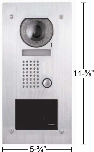
JB-DVF-HID (front view)