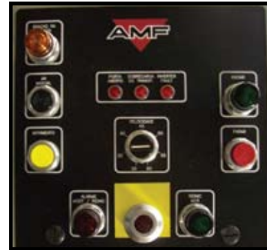
Operator Control Station