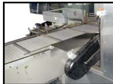
Flusher Discharge Conveyor