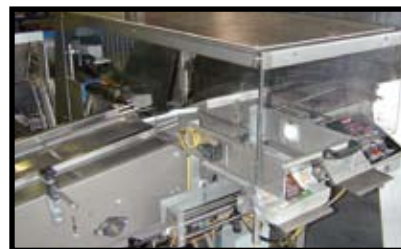
Automatic Dual Wicket Changer Option