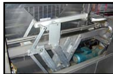
Pendulum Scoop Drive