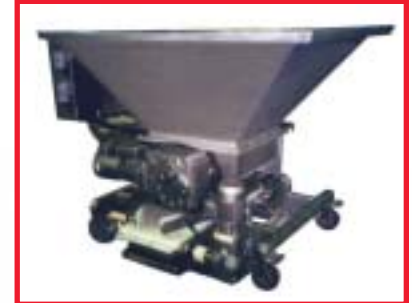
Showing with hopper, frame and conveyor.