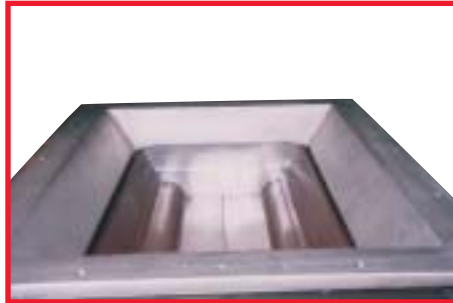
Teflon® coated rotary blades.