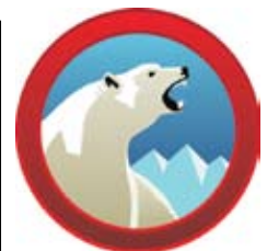
Arctic Cooling Package