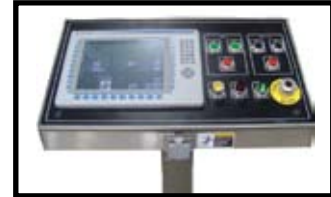
Optional Remote Pedestal Operator Console with Dough Quality Monitoring System