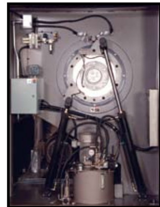
Hydraulic Tilt Mechanism Side