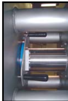
Sanitary Main Shaft Seal