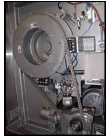
Mechanical Overtilt Options