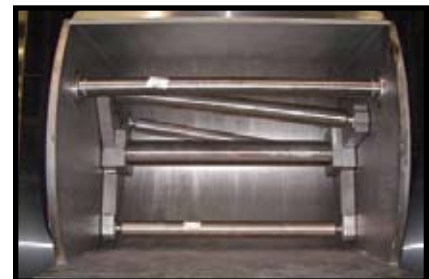
Optional Y-T Agitator