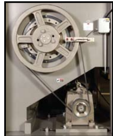
Agitator Drive Side