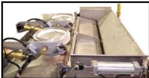
Mixer Top Canopy With Multiple Flour Inlets and Sponge Door