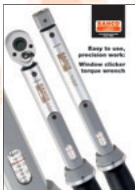
Mechanical torque wrenches