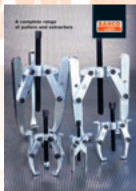
Pullers and extractors