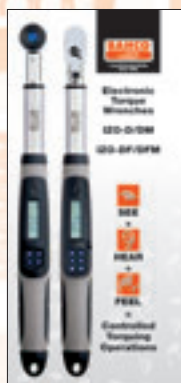
Electronic torque wrenches