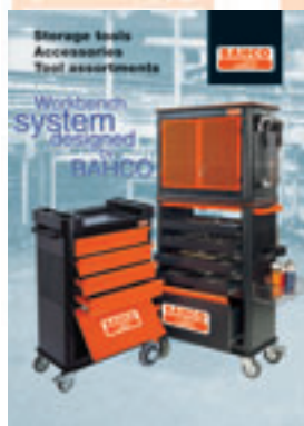
Workshop roll cabinets and accessories