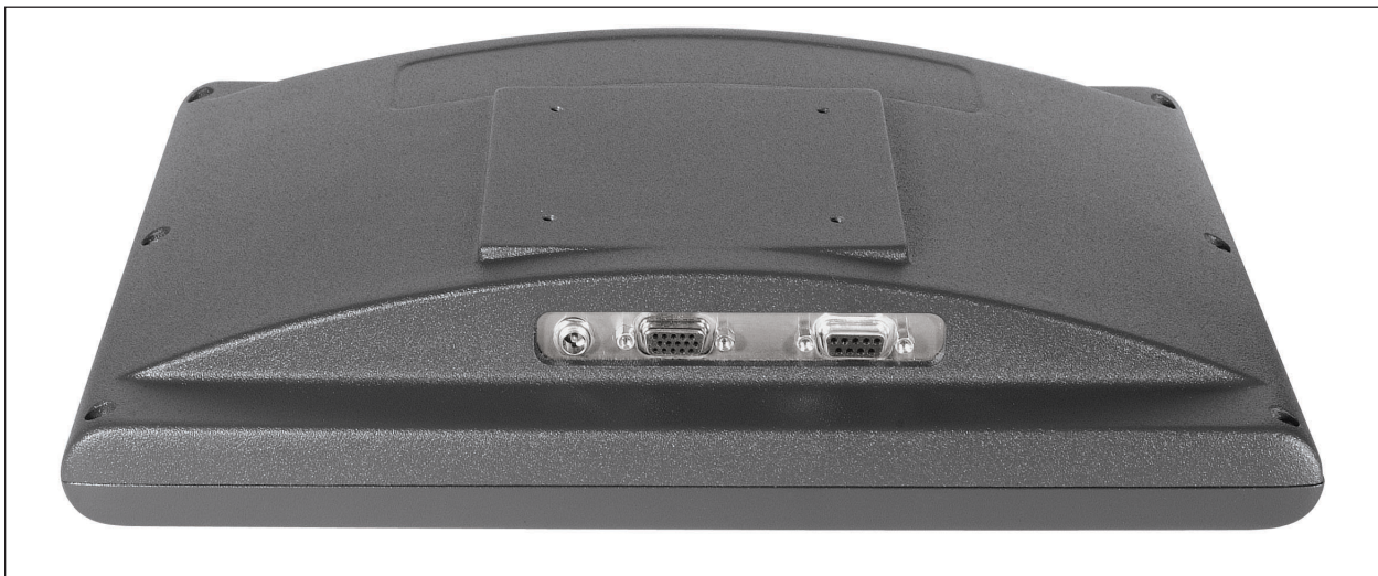
Power, VGA, & Touchscreen connectors on bottom of unit.

In addition to the above, the touchscreen model has an extra cable terminating in a 9-pin serial connector which connects to one of the PC's serial ports.