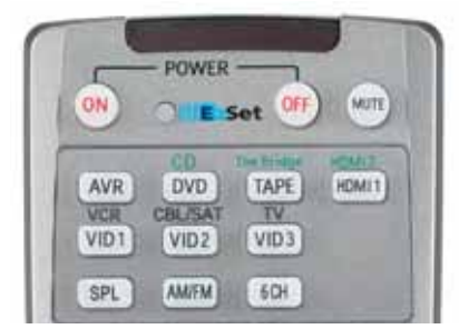
Figure 3 – EzSet (SPL) Button

Point the remote at the receiver. Press and hold the SPL Button until the LED remains steadily lit, then press the "5" key. See Figure 3. The procedure works best if you hold the remote at about ear level, pointed toward the receiver. Try not to tilt the remote out of line with the AVR's front panel.