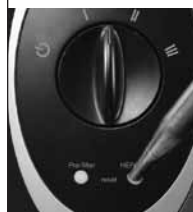
Fig. 4 Will illuminate when it is time to clean HEPA filters

NOTE: None of the filters are washable. Do not immerse them in water.